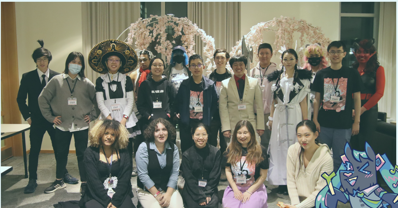
ScottyCon 2024 Staff